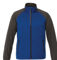
550 Metro Blue/Black Smoke Heather

There's a lot to love about the Mikumi Hybrid three-layer hybrid softshell jacket. Along with its trendy retail look, it's got unique features of reflective piping, thumb exits in the sleeves and a media exit port with cord guide. Offering lightweight comfort for the transitions between seasons, the Mikumi is waterproof and breathable with elasticized cuffs and an elastic drawcord at the hem.