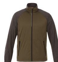
684 Loden/Black Smoke Heather