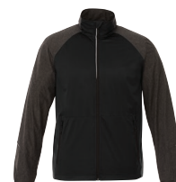
995 Black/Black Smoke Heather