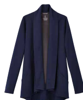
550 Metro Blue Heather

With the cozy Equinox Knit Blazer, we've created a fashion-forward look that women will love. Made with washable wool for easy care, it features a distinctive shawl collar, tapered waist and dropped back hem. This versatile knit blazer can take you from chic professional office attire to evening drinks with colleagues and friends.