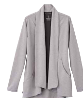
932 Heather Grey