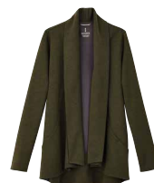
684 Loden Heather