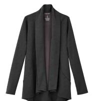
988 Heather Dark Charcoal