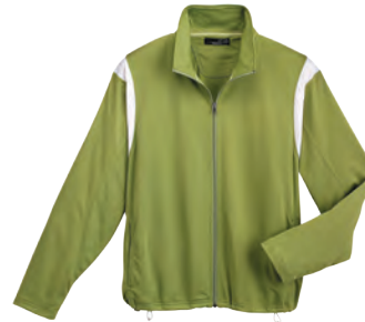
18109/98109 BALATON RECYCLE KNIT JKT

Fabric: Face: 100% Polyester Honeycomb MeshBack: 100% Polyester 250gm/ m2 Anti-pill Microfleece