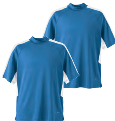
16503/96503 JRSY SAPNDEX CLR-BLK MOCK

Fabric: 100% Polyester bonded with polyester jersey. 230 gm/m2 (11.5 oz/linear yd)