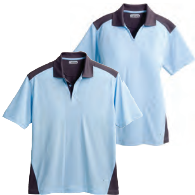
16304/96304 BOWMAN CLR-BLOCKED SS POLO

Colour: Vintage Red, Black White ( Men's Only ) Creek ,Dark Citron Green White ( Women'sOnly ) Fabric: 65% Polyester / 35% Cotton