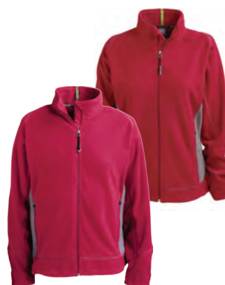
18125/98125 OVERLAND MICROFLEECE JKT