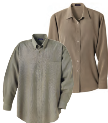
17642/97642 PARSONS LONG SLEEVE SHIRT

Fabric: Shell: 100% high-count polyester with water resistant coating.