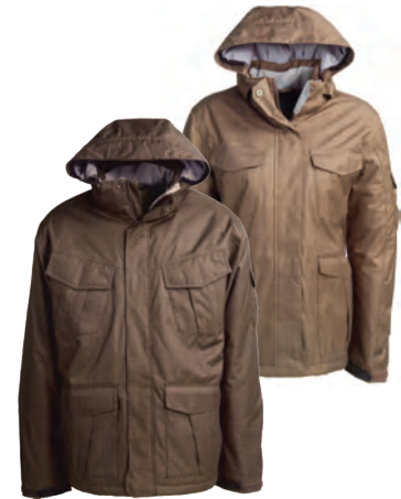
19551/99551 BERGEN INSULATED JACKET

100% Polyester 240T. PA Coating, Water Repellant.