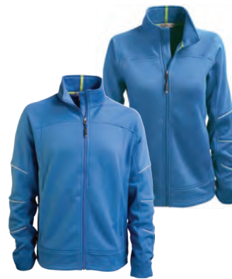
18122/98122 PIPER PIQUE FLEECE JACKET

Fabric: 100% polyester WEBTech™ 300 series