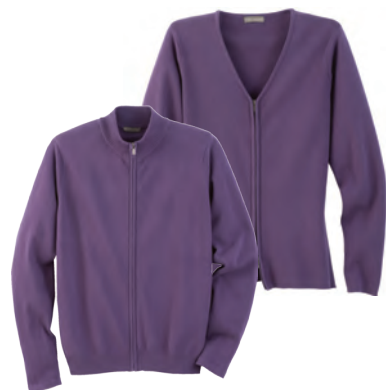
18605/98605 VARNA FULL ZIP SWEATER

Fabric: 100% polyester WEBTech™ 300 series