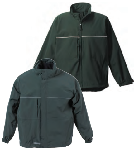
19299/99299 LAURENTIAN 3-IN-1 JACKET