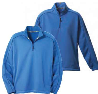
18301/98301 1/4 ZIP BONDED FLEECE