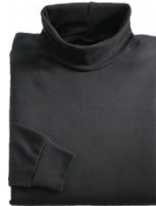
57875 TURTLE NECK

Fabric: 80% Recycle Polyester Fleece / 20% Polyester Fleece. 220 gm/m2 (10.8 oz/linear yd)