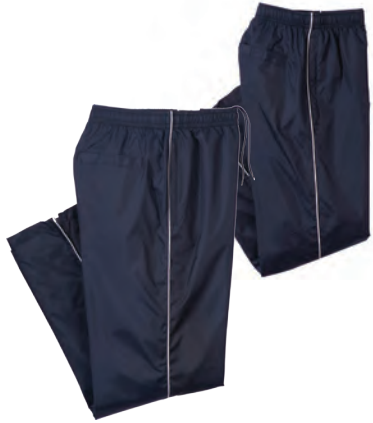
12398/52398 MESH LINED TRACK PANT