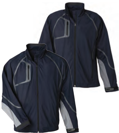
19506/99506 VARLEY TECHNICAL JACKET