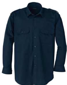
17736 TWILL LONG SLEEVE SHIRT