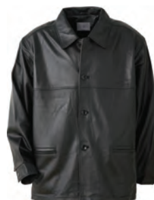
19875 LAMB LEATHER STROLLER

Fabric: 100% Polyester blanket fleece. 200 g/m2 (9.8 oz/linear yd).