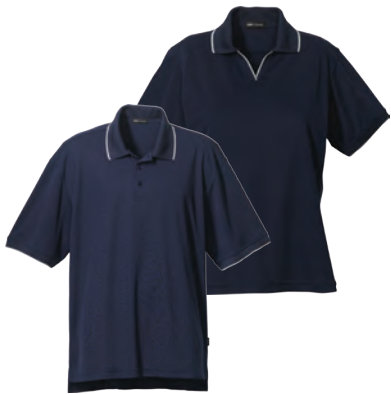
16302/96302 CLASSIC CUT SHIRT

Fabric: 100% Brushed Micro Poly with PU coating