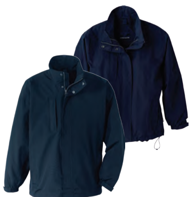
19264/59264/99264 INTERACTIVE JACKET

Fabric: 92% polyester / 8% spandex jersey WEBTech™ 500 series