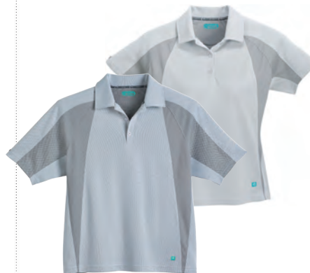
16774/96774 EXCEL POLO