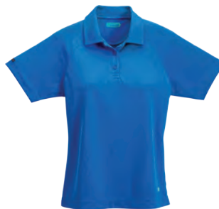
96339 LINDEN COCONUT CHARC POLO

Fabric: 100% Taslan Nylon and 100% Polyester liner