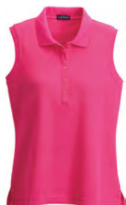
96212 BRINS SLEEVELESS POLO

Fabric: 92% polyester / 8% spandex jersey WEBTech™ 500 series