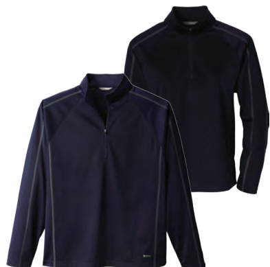
17803/97803 STRETCH TRICOT ZIP