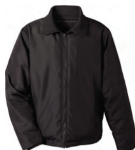
19261 PADDED NYLON JACKET

Fabric: 100% Italian Lamb LeatherLining : 50% nylon / 50% acetate lining