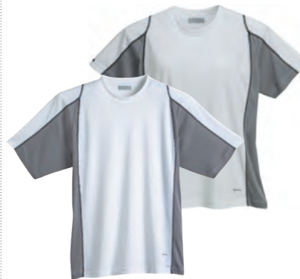
16365/96365 TENOR CREW NECK TOP

100% Polyester Textured Yarn dyed fabric with waterproof/ breathable coating. 190 gm/m2 (9.3 oz/linear yd)