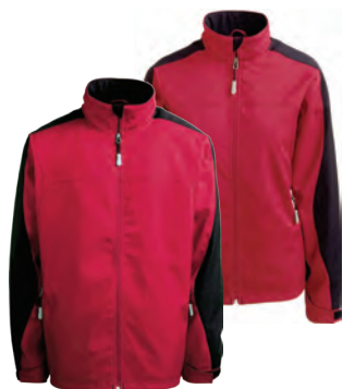
19517/99517 ARENDAL INSULATED S-SHELL

Fabric: 100% Recycled polyester two sides brushed fleece with anti-pill finish. 190 g/m2 (9.3 oz/linear yd).