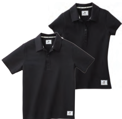
16605/96605 MONTAGUE ROOTS73 SS POLO

Colour: Vintage Red,China Blue, Navy, Dark Plum, Cactus Green, Heather Charcoal, Black Fabric: 70% Cotton / 30% Nylon jersey knit. 12 gauge.