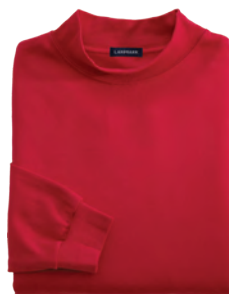
17850 Mock neck

Fabric: 100% Super Soft Combed Cotton, Pre-Washed, Wrinkle Resistant