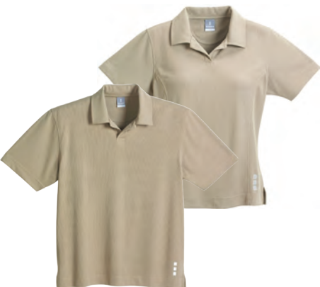
716000/796000 CORVUS SS TECH POLO