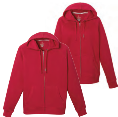
18204/58204/98204 KOZARA FLEECE F/Z HOODY

Colour: White, Stone, Sunset, Spark, Vintage Red, Aqua, Bay Blue, Navy, Fern, Midland Green, Black Vin Red Secondary (Women's Only) Fabric: 100% Bio-Wash cotton