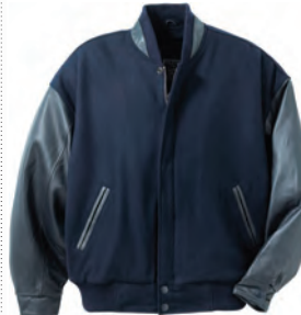
19816 CLASSIC MELTON JACKET