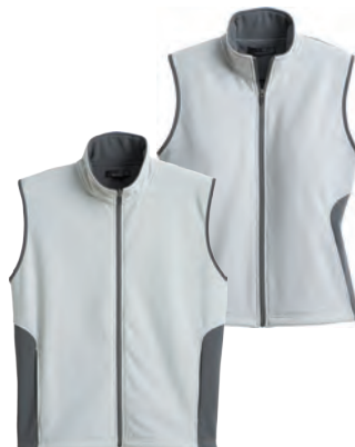
18595 /98595 CORAZON RECYCLED VEST

Fabric: 100% Polyester Microfleece bonded with matte finish microfibre. 130g Micro Poly Fleece, with waterproof, windproof, breathable membrane.