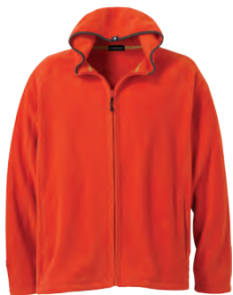
18201 F/ZIP HOODED MICROFLEECE

Fabric: 72% Polyester/28% Polyester Bamboo Charcoal