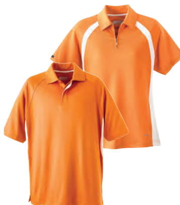
16502/96502 JRSY SPANDEX CLR-BLK POLO