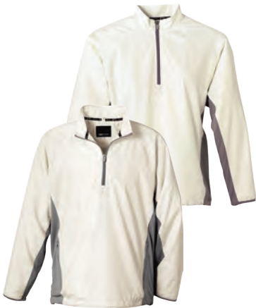
12102/92102 1/2 ZIP WINDSHIRT

Fabric: 100% cotton indigo denim 5.7 oz/sq yard