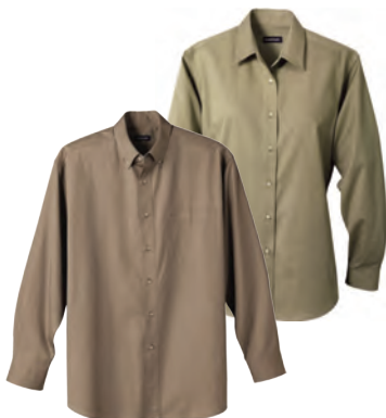
17306/97306 TWILL LONG SLEEVE SHIRT

Colour: Winter White, Sienna, Vint age Red/ Black, Navy/Titanium, Black/Titanium