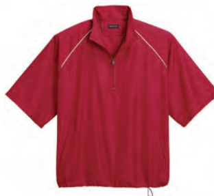
12164 DIRAN SS 1/4 ZIP WINDSHIRT

Fabric: 60% Micro Polyester/40% Bamboo Pique with In-House Wicking. 183 g/m 2 (8.8 oz/linear yd).