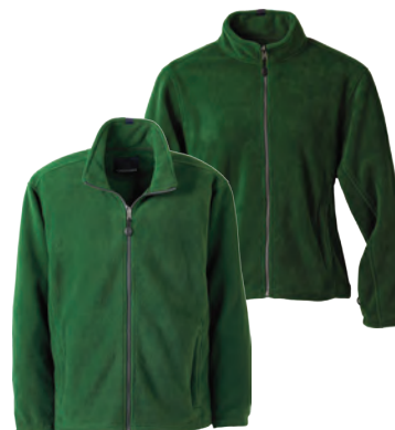
18104/58104/98104 BARTLETT FLEECE FULL ZIP

Fabric: Shell: 100% 228T Nylon Full Dull Taslan® coated with 2500mm Waterproofness