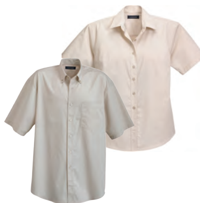
17726/97726 NOLAN SHORT SLEEVE SHIRT

Fabric: Shell: 100% 228T Nylon Full Dull Taslan® coated finish Upper Lining: mesh Front/Sleeves/Lower Lining: 100% 190T Nylon