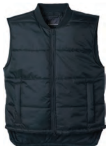
19402 VERWALL INSULATED VEST