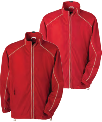
12602/52602 MESH LINED COACHES JACKET