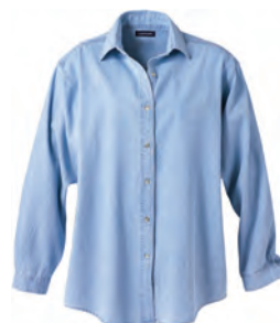
97460 LIGHT DENIM SHIRT