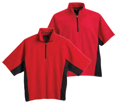
12603/92603 FALCON HALF ZIP WINDSHIRT

Fabric: 100% Polyester with Water-resistant finishLining: 100% 210T Polyester Padding: Sleeve 3-oz. Insulation Quilted TaffetaBody: 4-oz. Insulation Quilted Taffeta/Polar Fleece