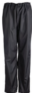
12326 LEVITT RAIN PANT

Fabric: 100% Genuine Nappa LeatherLining: Upper Body - Anti-pill Micro Polar Fleecebody - 2 oz. Insulation Quilted TaffetaSleeve: 2-oz. Insulation Quilted Taffeta