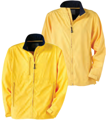
12902/92902 MICRO BONDED JACKET