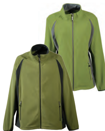
18149 /98149 VOLCAN RECYCLED JACKET

Fabric: 60% Cotton / 40% Recycle Micro Polyester Birdeye with In-House Wicking. 160 g/m2 (8 oz/linear yd).