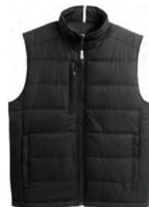
19536 BEAUFORT QUILTED VEST