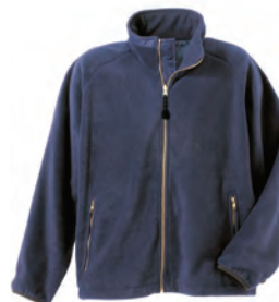
18178 CHETWOOD FLEECE F/Z JACKET