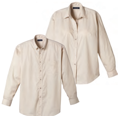
17716/97716 NOLAN LONG SLEEVE SHIRT