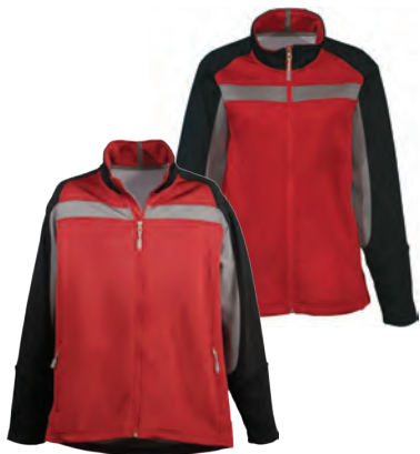
18114/98114 POLARIS KNIT JACKET