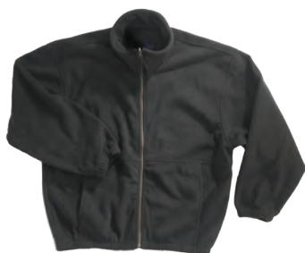
18100 SESTON FLEECE FULL ZIP JKT

Fabric: Shell: 100% Spun Polyester 280gm/m2 Anti-pill Fleece Sleeve Lining: 100% 190T Nylon