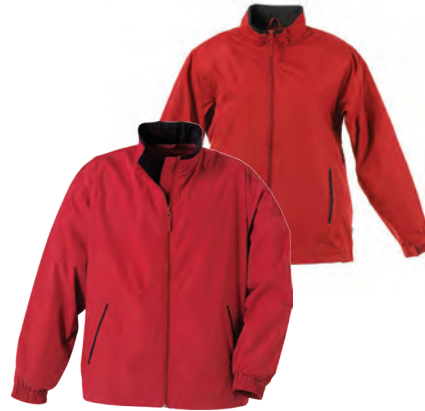
12618/92618 BAYSIDE MICROPOLY JACKET

Fabric: Body: 100% Nylon 210T. Lining: 100% Polyester mesh lined body / 100% Polyester taffeta lined lower leg.