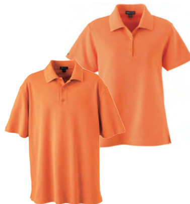
16330/96330 PIQUE STRIPED POLO

Fabric: 100% polyester WEBTech™ 300 series