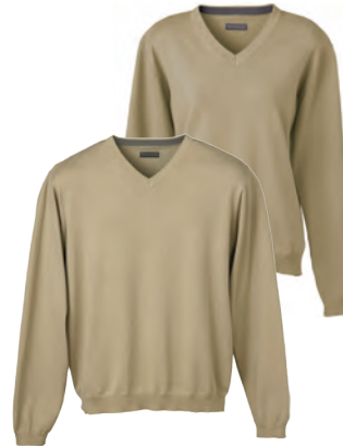
18600/98600 FREDERICK V-NECK SWEATER

Fabric: 100% Polyester Anti Pill Microfleece, 250gm/m2