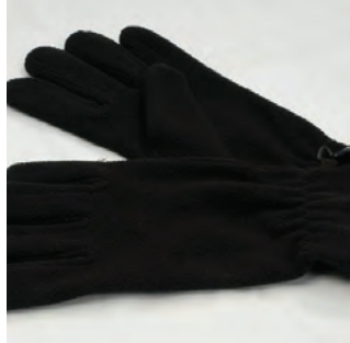
45124 TOVAR RECYCLED FLC GLOVES