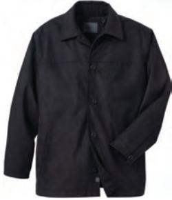
19401 MICRO SUEDE JACKET