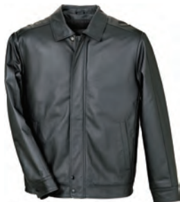
19818 NORTE INSULATED JACKET