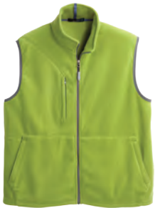
18547 RECYCLED POLY FLEECE VEST

Fabric: Shell: 100% Nylon Taslan Upper Lining: 100% Polyester, Anti Pill Fleece Lower Lining: 100% Nylon