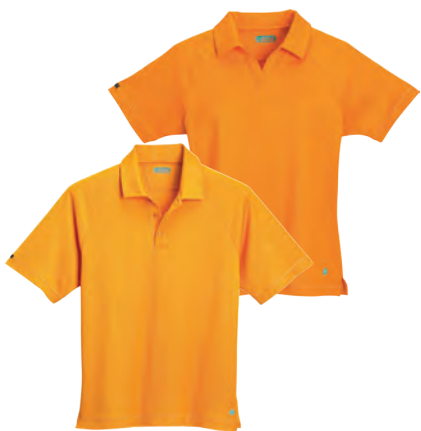
16331/96331 FREMONT RECYCLED SS POLO