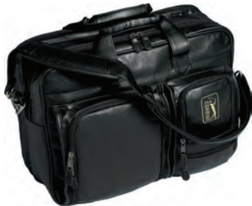
45545 LAMTEC™ Exec B/C

Fabric: Shell: 100% Cotton Canvas, 10 oz with 600mm Water Resistant coatingLining: 100% 210T NylonPadding: 4oz polyfill