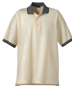
16601 WOODCREEK POLO SHIRT