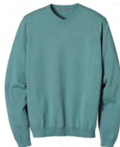
18603 FREEPORT V-NECK SWEATER

Fabric: 100% Polyester bonded to 100% Polyester microfleece. Total weight 290 g/m2 (14.3 oz/linear yd).