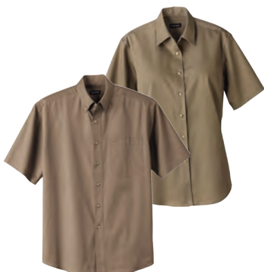
17307/97307 Twill short sleeve shirt

Fabric: 50% Cotton/50% Polyester, 8.5 oz Lycra in the collar and cuffs