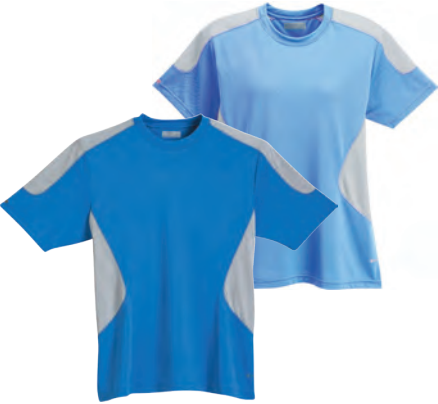
16357/96357 PAYTON CREW NECK