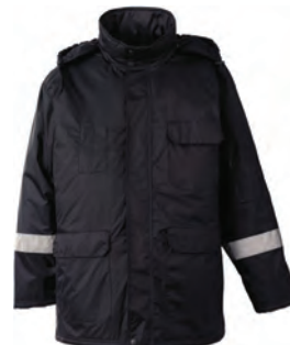
19271 NYLON PARKA

Fabric: 100% PU Lamtec™ simulated leather.