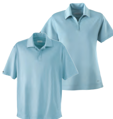
16501/96501 Jersey spandex polo