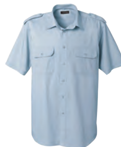
17738/19272 TWILL SHORT SLEEVE SHIRT

Fabric: 100% Cotton jersey knit hood and interior pocket.