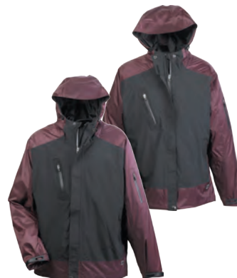
19515/99515 AMHERST TECHNICAL SHELL

Fabric: 100% Polyester micro-ripstop Lining: 100% Polyester Taffeta Insulation: 100% Polyester Soft Polyfill. 100 gm/m2 (5 oz/ linear yd)