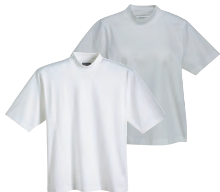
17867/97867 VELOCITY MOCK NECK JERSEY