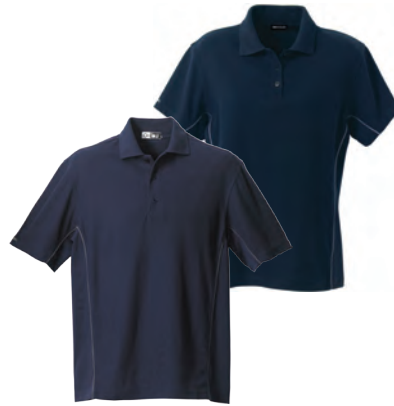
16345/96345 BASKET WEAVE GOLF SHIRT

Colour: White/Silver strip, Vin Red/Silver stripe, O. Blue/Silver Stripe, Navy/ Silver Stripe, Black/Silver Stripe Fabric: Body: 100% Micro Polyester with 100% Coated Yarn. 160 g/m2 (8 oz/linear yd). Polyester Solid & Stripe with In-House Wicking. Mesh Panel: 100% Micro Polyester Mesh with In-House Wicking. 152 g/m2 (7.4 oz/linear yd).