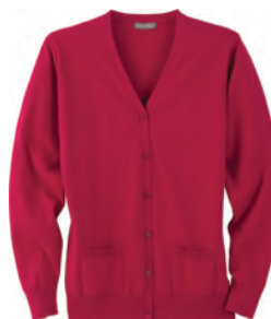
98604 NARENTA CARDIGAN