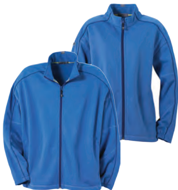
18101/98101 BONDED F/ZIP FLEECE JACKET

Fabric: 600D/820D Polyester with PU back coating