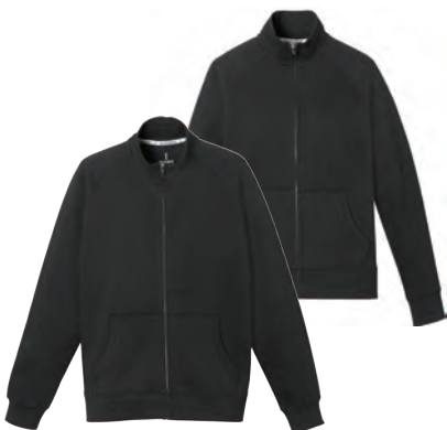
18116/98116 SILAS FLEECE FULL ZIP JKT

Colour: White, Autumn Red, Chili, Navy, Fern, Charcoal, Black Fabric: 100% Microfibre Polyester WEBTech™ 300 Series