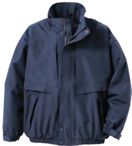
19263 DORSET BOMBER JACKET

Fabric: 100% Nylon Oxford/Water Repellant FinishLining Body: 100% Polyester Pile Fleece. 280 gm/m2 (13.8 oz/ linear yd)