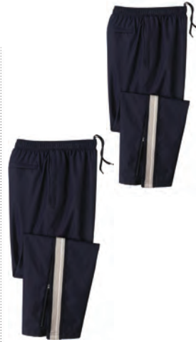
12321/52321 POLY TRACK PANT

Shell: 100% Micro Suede Polyester Upper Body Liner: 100% Quilted Nylon Taffeta Lower Body Liner: Micro Poly Fleece, 250 gm/m2