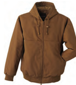
19262 ROWLEY INSULATED JKT

Fabric: Shell: 100% Micro Polyester Body Lining: 100% Polyester Tricot Sleeve Lining: 100% Polyester