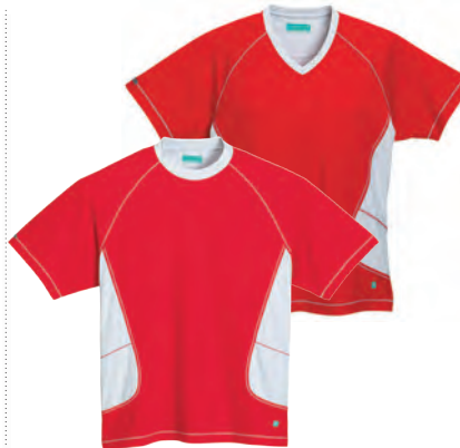
16374/96374 KOMATI RECYCLED TECH TOP

100% Polyester 240T. PA Coating Water Repellent.Upper Lining: 100% Polyester Mesh.Lower Lining: 100% Polyester Taffeta.