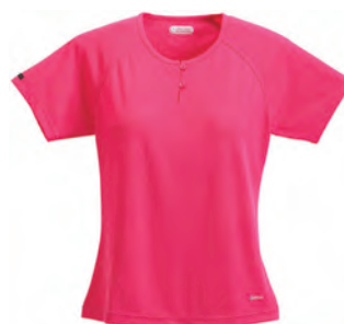
96395 WEBTECH™ GOLF TOP

Fabric: 80% Cotton 20% Nylon jersey knit. 10 gauge.