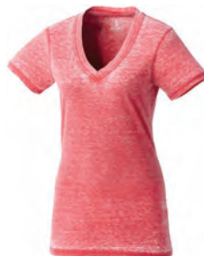
97898 NORTHSHORE BURNOUT SS TEE

Fabric: Shell: 100% Polyester dobby with water resistant coating. Lining: 100% Polyester taffeta channel quilted to soft polyfil insulation. 100% Polyester brushed tricot inner collar and pocket bags. 100% Polyester mesh inside storage pocket. Insulation: 100% Polyester soft polyfil in body 4 oz sleeves & hood 3.5 oz