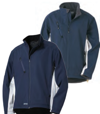
19501/99501 ATLAS SOFTSHELL JACKET