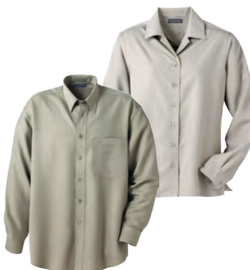
17340/97340 MICRO HERRINGBONE SHIRT

Fabric: 65% Polyester/35% Cotton pique. 210 g/m2 (10.3 oz/linear yd)