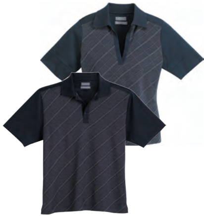
16472/96472 AXIS POLO