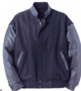
19815 MELTON JACKET

Fabric: 55% Cotton 45% Polyester burnout fleece. Approx. weight 190 g/m 2 (5.6 oz/yd 2 ). Contrast: 95% Cotton / 5% Spandex 2 x 1 rib knit sleeve cuffs and body hem.