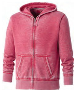
18118 RIDGEMONT BURNOUT FLC HDY