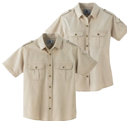
17799 /97799 GRANDBAY ROOTS73 SS SHIRT