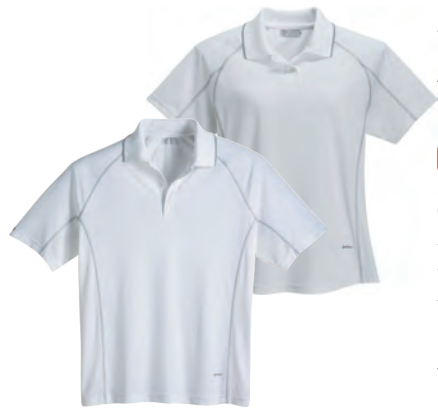
16360/96360 AFFINITY SS POLO