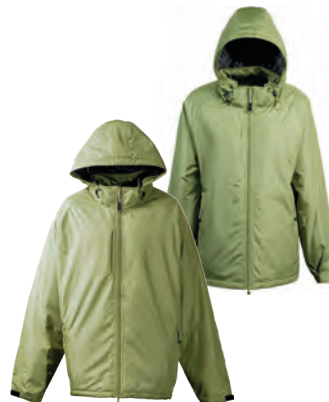
19518 /99518 SEVERN INSULATED JACKET

Fabric: Shell: 95% Polyester/5% Spandex yarn dye laminated to waterproof/ breathable membrane bonded to 100% Polyester soft boucle fleece. Total weight 430 g/m2 (21.1 oz/linear yd).