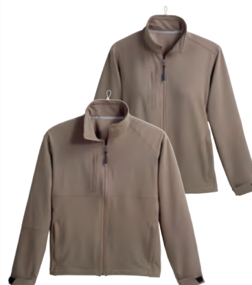
12929/92926 DAWSON FULL ZIP JACKET

Fabric: 70% Wool / 30% Rayon Melton, 24oz/yd