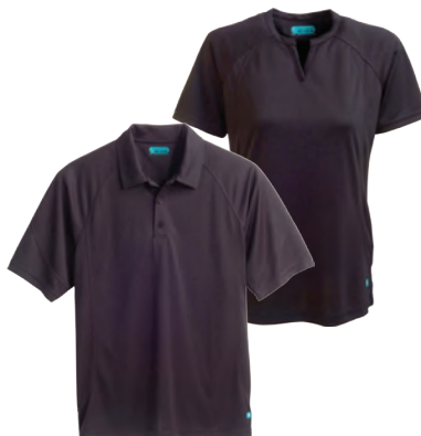
16778 /96778 CAYLEY SHORT SLEEVE POLO

Fabric: 65% Polyester/35% Cotton Twill. 4.4 oz / linear yd