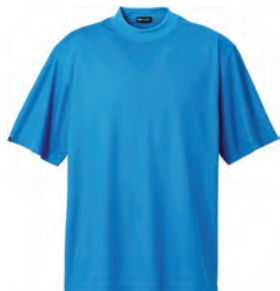
16716 ZIP NECK GOLF SHIRT