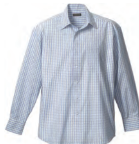
17304 DOOBY WOVEN CHECK SHIRT