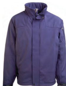
19591 HALDEN FULL ZIP INSULATED

Fabric: 100% Polyester Mesh Bonded with anti-pill Micro Fleece. 295 gm/m 2 (14.5 oz / linear yd)