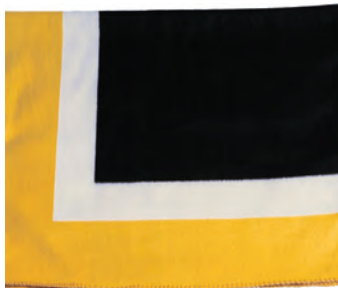
45105 FLEECE BORDER BLANKET

Fabric: 100% Micro Polyester LINING: 100% Polyester