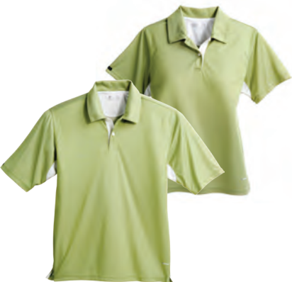
16328/96328 CARLTON 2-TONE PIQUE POLO