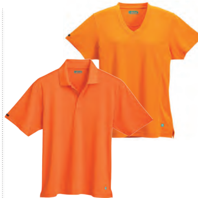
16399/96399 PERICO RECYCLED POLO

Fabric: 100% Taslan Nylon and 100% Polyester liner