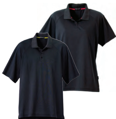
16301/96301 SOLID MICROFIBRE SS POLO

Fabric: 100% Polyester Bonded Fleece Face: Honeycomb Mesh Back: Micro Poly Fleece, 250gm/m2