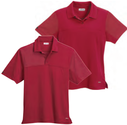
16384/96384 ONYX PANEL STRIPE SS POLO