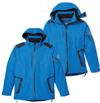
19519/99519 ELIAS INSULATED JACKET

Fabric: Shell: 95% Recycled Polyester/5% Spandex. Bonded with 100% Polyester Fleece Anti-Pill One Side Brushed. 310 g/m 2 (15.2 oz/linear yd) Water Repellent.