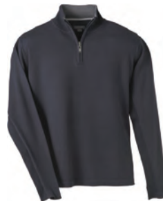
18601 MCKAY 1/2 ZIP SWEATER

Fabric: 55% Cotton 45% Polyester burnout fleece. Approx. weight 190 g/m 2 (5.6 oz/yd 2 ). Contrast: 95% Cotton / 5% Spandex 2 x 1 rib knit sleeve cuffs and body hem.