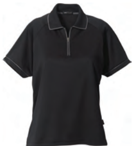
96792 ZIP NECK GOLF SHIRT