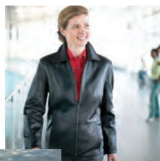
19870/99870 LAMB LEATHER BOMBER

Fabric: 100% Polyester 240T Dewspo P/D, W/R 350 mm coated, Cire Finish.Lining : 100% Polyester Mesh/Polyester Taffeta.