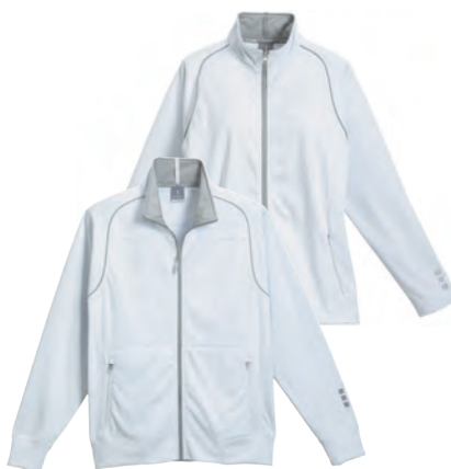
717010/797010 ELECTRA FULL ZIP JACKET