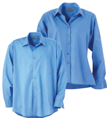
17301/97301 Super soft cotton shirt

Fabric: 95% Polyester 5% Spandex heather jersey knit with wicking finish. 178 g/m 2 (8.7 oz/linear yd)