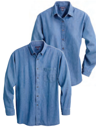
17451/97451 SANFORD LS DENIM SHIRT