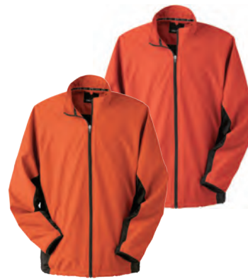
12201/92201 RADIUS MICROPOLY WINDSHIRT

Colour: Sienna/Charcoal, Vintage Red/Chilli, Peak/Charcoal, Nautical/Navy, Moss/ Woodland, Black/Charcoal Fabric: 100% Micro polyester