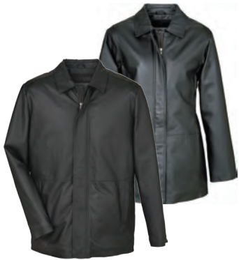
99813/19813 ANGUS MEADOWS LEATHER JKT