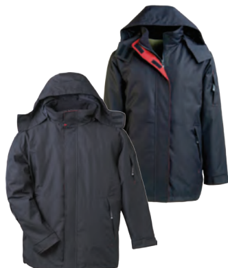
19511/99511 ROUGE RIVER INSULATED JKT

Fabric: Exterior: 100% Nylon Taslan Interior: 100% Polyester Mesh Upper Lining and Nylon Lower