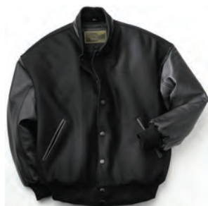
19817 VARSITY JACKET

Fabric: 100% Microfibre Polyester, WEBTech™ 300 Series