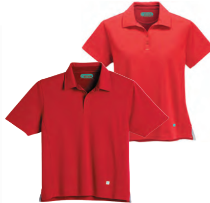
16749/96749 BYRON SS POLO

Fabric: Recycled polyester fleece two sides brushed with anti-pill finish. 180 g/m2 (8.8 oz/linear yd).