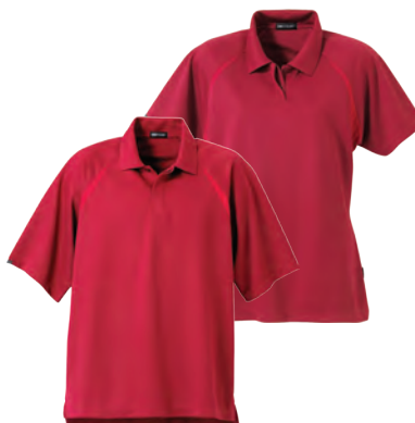
16795/96795 3D TEXTURED GOLF SHIRT