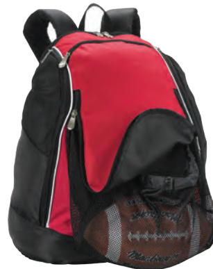
45301/45301 TEAM SPORT BACKPACK