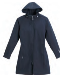
92000 LYNX 3/4 HOODED JACKET