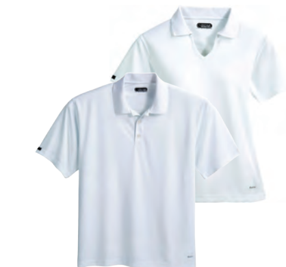
16286/96286 DONARD SOLID POLO