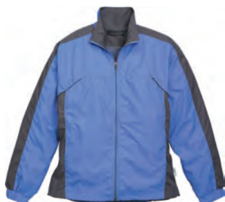
92957 SUMACO RECYCLED JACKET

Colour: Varsity Red/Lt Charcoal, White/Lt. Charcoal Navy/white, Black/Lt Charcoal