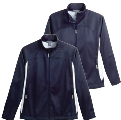
18111/98111 GRENVILLE BONDED FLEECE

Fabric: 100% Polyester micro-ripstop. Lining: 100% Polyester Taffeta. Insulation: 100% Polyester Soft Polyfill. 100 gm/m 2 (5 oz/ linear yd)