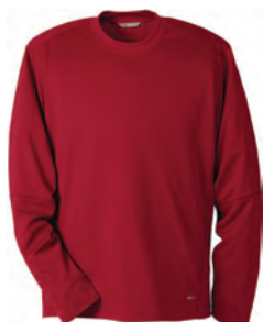
17805 TEXTURED LONG SLEEVE TEE

Fabric: 100% Italian Lamb LeatherLining: 50% Nylon / 50% Acetate