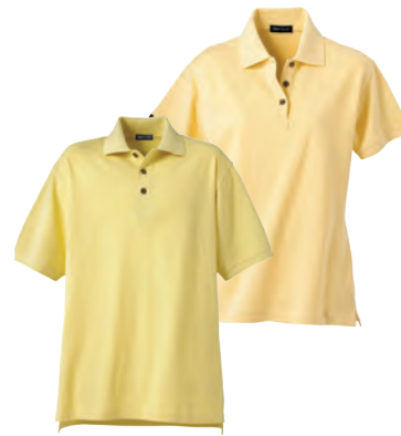
16625/96625 DESERT SANDS GOLF SHIRT

Fabric: 100% Microfibre Polyester Pique, WEBTech™ 300 Series