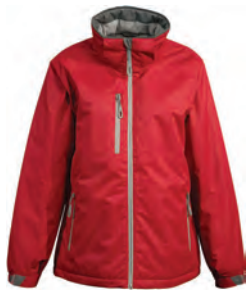
99516 NORTE INSULATED JACKET