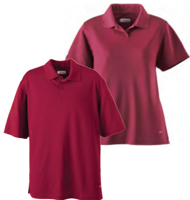
16379/96379 OTTOMAN TEXTURED POLO