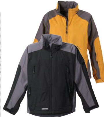
19510/99510 BLIZZARD INSULATED JACKET

Fabric: 100% Genuine Nappa Leather Lining: Body: 4 oz. Insulation Quilted Taffeta Sleeve: 2-oz. Insulation Quilted Taffeta