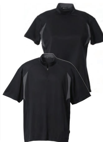
16329/96329 ZIP MOCK NECK SHIRT

Fabric: 100% Nylon 210D Oxford, Water Resistant Coating Body Lining: 190T Nylon Quilted to 4oz polyfill