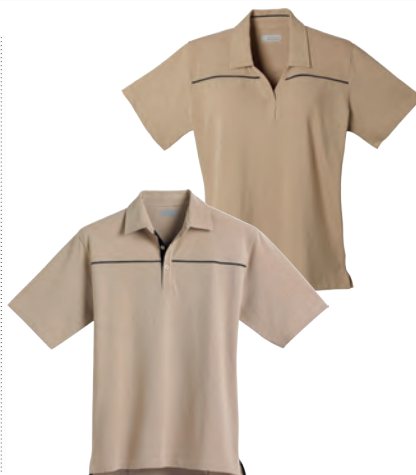
16268/96268 HANK POLO

Fabric: 100% Micro Polyester Body Lining: 100% Polyester Tricot Sleeve Lining: 100% Polyester