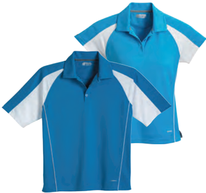
16752/96752 SONIC POLO

Fabric: 100% Polyester with Water-Resistant Finish