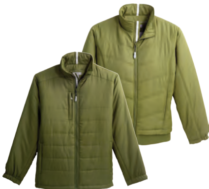
19537/99537 HARRISON QUILTED JACKET