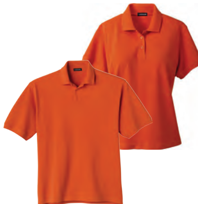
16626/96626 AYER SHORT SLEEVE POLO

Colour: Dune, Navy, Juniper, Black Pacific ( Men's Only) Chill ( Women's Only) Fabric: Shell: 53% Micro polyester / 47% Recycled polyester drop needle rib with wicking finish. 190 g/m2 (9.3 oz/linear yd).