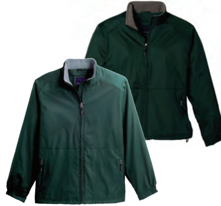
19498/99498 CASCADE FLEECE LINED JKT

Fabric: 100% Micro Polyester Pique WEBTech™ 300