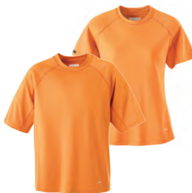
17831/97831 JURA SHORT SLEEVE TECH TEE

Fabric: 100% Nylon taslan with waterproof, breathable coating and water repellent finish. 145g/m 2 (7 oz/linear yd)