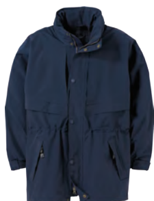
19273/59273 HUDSON JACKET

Fabric: 100% 10-oz. Cotton Canvas with Water-resistant Coating | Lining: 100% 210T Nylon | Padding: 2-oz. Insulation Quilted Taffeta