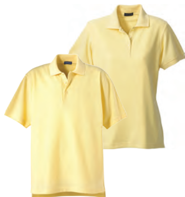
16202/96202 MADERA SHORT SLEEVE POLO

Fabric: 70% Cotton 30% Nylon jersey knit. 12 gauge.