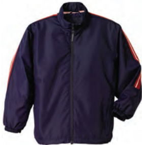
52311 POLY TRACK JACKET

Shell: 100% Micro Suede Polyester Upper Body Liner: 100% Quilted Nylon Taffeta Lower Body Liner: Micro Poly Fleece, 250 gm/m2