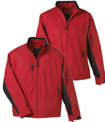
19514/99514 PEMBROOK INSULATED JACKET