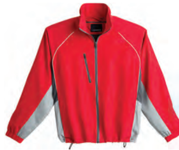
12349 NORWOOD TRACK JACKET