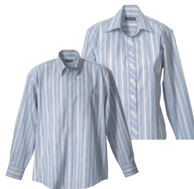
17303/97303 PINSTRIPED DRESS SHIRT

Fabric: 100% Polyester Bonded Fleece Face: Honeycomb Mesh Back: Micro Poly Fleece, 250gm/m2