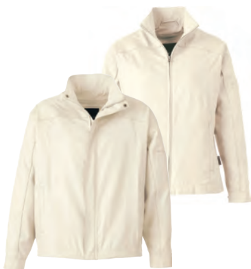
12903/92903 CLASSIC JACKET

Fabric: 75% Polyester/25% Polyester Bamboo Charcoal