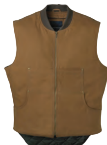
19405 MILLIKEN INSULATED VEST