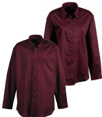
17732 /97732 BARU LONG SLEEVE SHIRT