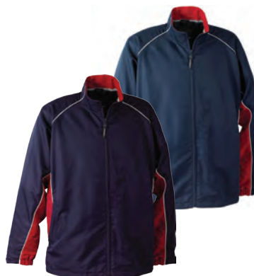
12312/52312 JERRETT TRACK JACKET

Colour: Navy, Heather Grey, Black Fabric: 80% Cotton 20% Polyester washed fleece. 300 g/m 2 (8.9 oz/yd 2 )