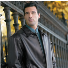
19851 METRO LEATHER JACKET