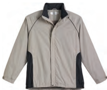
12306 LEVITT RAIN JACKET

Fabric: 70% wool/30% rayon melton, 24 oz/yd, Garment-grade Leather Sleeves