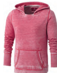
98403 LAKEVIEW BURNOUT KANGA

Fabric: 80% Recycle Polyester Fleece / 20% Polyester Fleece. 220 gm/m2 (10.8 oz/linear yd)