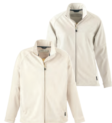
12105/92105 TECHNICAL JACKET