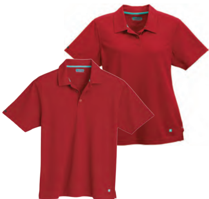
16380/96380 ALDER BAMBOO SS POLO