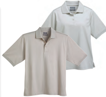
16647/96647 EXPLORE SHORT SLEEVE POLO

Fabric: 100% Micro Polyester Bonded Fabric