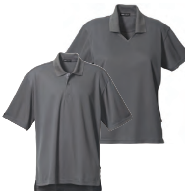
16300/96300 ELDEN SHORT SLEEVE POLO

Colour: Team Red, Navy, Forest Green, Heather Grey, Black Fabric: 80% Cotton 20% Polyester washed fleece. 300 g/m 2 (8.9 oz/yd 2 )