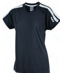
797003 HYDRUS SHORT SLEEVE-T

Fabric: 100% Nylon 210D Oxford, Water Resistant Coating Body Lining: 190T Nylon Quilted to 4oz polyfill