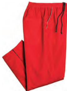
12399 NORWOOD TRACK PANT