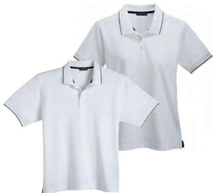
16253/96253 TIER POLO

Fabric: 55% cotton / 45% polyester WEBTech™ 300 series