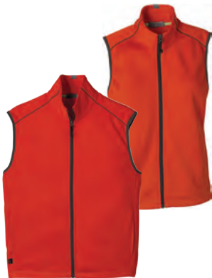
18593/98593 BONDED MICROFLEECE VEST

Fabric: 70% Recycled Micro Polyester/30% Micro Polyester Horizontal Texture Stripe with In-House Wicking. 169 g/m2 (8.4 oz/linear yd).