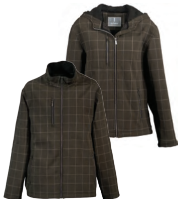
19508/99508 CABRILLO SOFTSHELL JACKET