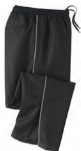
12322 TWILL TRACK PANT W/ PIPING

Fabric: 55% Cotton / 45% Polyester burnout jersey knit. Approx. weight 120 g/m 2 (3.5 oz/yd 2 ). Contrast: 55% Cotton / 45% Spandex 1x1 rib knit collar (men's)