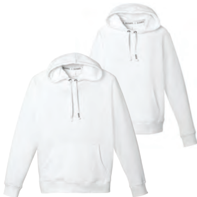
18406/98406/58406 RYTON FLEECE KANGA HOODY

Fabric: 100% Polyester Pique Fleece. 255 gm/m2 (12.5 oz/linear yd)