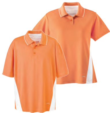
16303/96303 COLOUR-BLOCKED PIQUE POLO