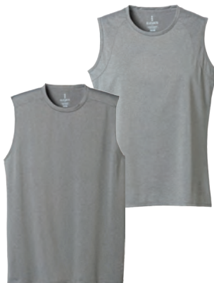
17882/97882 PIKES Sleeveless tee

Fabric: 30% Recycled polyester/35% Polyester/35% Cotton twill 150 g/m2 (7.5 oz/linear yd).