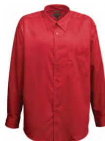
17302 FINE COTTON DRESS SHIRT

Fabric: 100% Cotton jersey knit. 180 g/m 2 (5.3 oz/yd 2 )