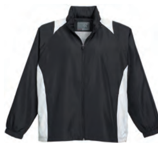
92263 VERANO LIGHTWEIGHT JACKET

Fabric: 100% Micro Polyester Lining: 100% Polyester Mesh