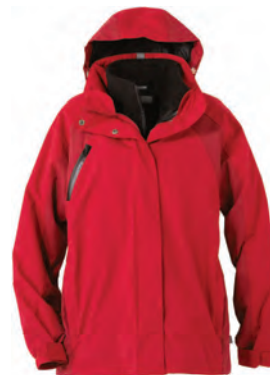
99301 TECHNICAL 3-IN-1 JACKET

100% Polyester. 150 gm/m2 (7.4 oz/linear yd)