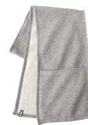
932 Heather Grey