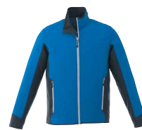
431 Olympic Blue/ Grey Storm