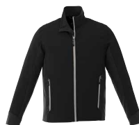
995 Black/Grey Storm