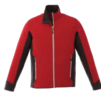
358 Team Red/ Grey Storm

The Sopris Softshell Jacket features three-layer construction for lightweight warmth and comfort. Designed with a breathable, waterproof membrane, it's got stylish details inside and out, from grey colour blocking and a colour-pop zipper to a heathered knit interior. And with an interior pocket and media exit port, you can run a pair of earbuds from inside the jacket.