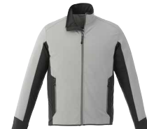
927 Silver/Grey Storm