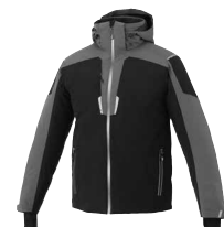
995 Black/Grey Storm