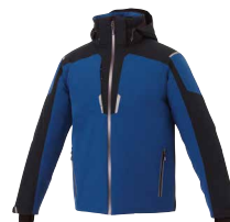
550 Metro Blue/Navy

When the weather turns nastier, be ready with this fully seam-sealed jacket. The Ozark Insulated Jacket is constructed with ECHOHEAT thermal reflective technology that uses body heat to help keep you warm. Available in four distinctive colour combinations.