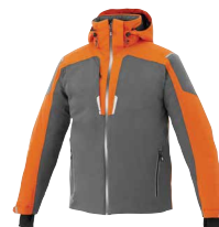
991 Grey Storm/Saffron