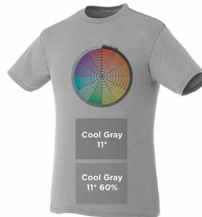
939 MEDIUM HEATHER GREY