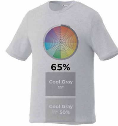
932 HEATHER GREY