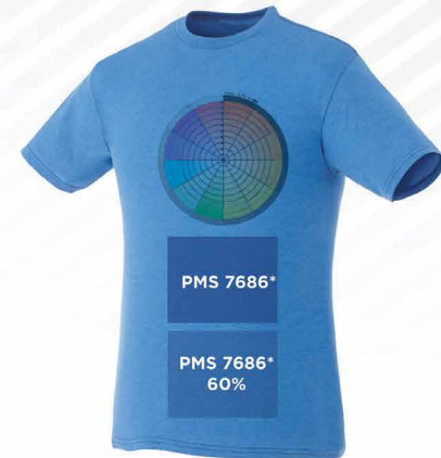
561 NEW ROYAL HEATHER