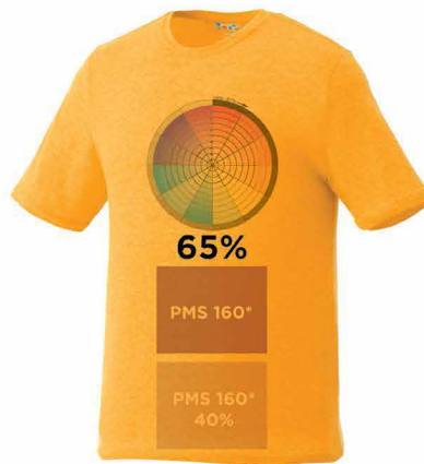
236 AMBER HEATHER