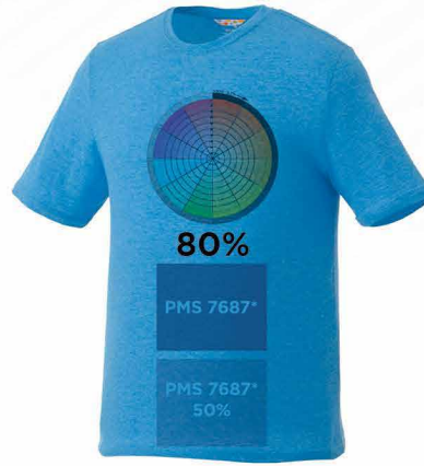
431 OLYMPIC BLUE HEATHER