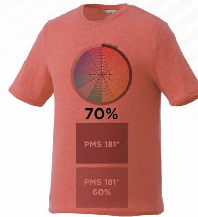
358 TEAM RED HEATHER