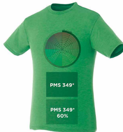
638 KELLY HEATHER