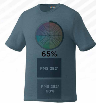
575 NAVY HEATHER