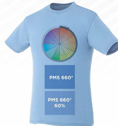
422 SKY HEATHER