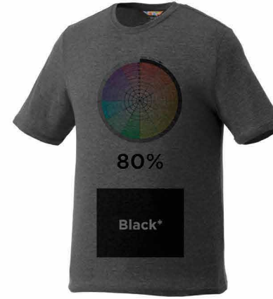
988 HEATHER DARK CHARCOAL