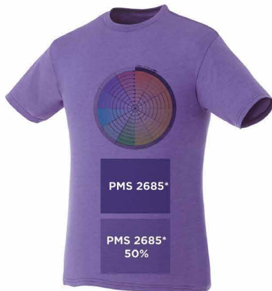
590 PURPLE HEATHER