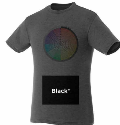
988 HEATHER DARK CHARCOAL