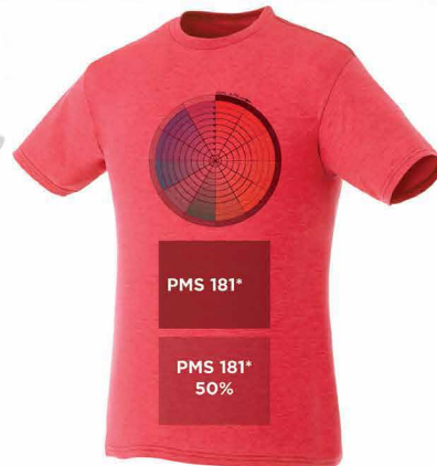
358 TEAM RED HEATHER