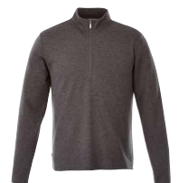
988 Heather Dark Charcoal