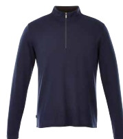
550 Metro Blue Heather

The Stratton Knit quarter for men's and half zip for women's offers a traditional professional look for men and women – with some key differences between the two. While the men's has a stand collar and fits well over a shirt and tie, the women's has a convertible collar, dropped back hem and tapered waist for a flattering fit. Both, however, are made with washable wool that makes it easy to wash and wear.