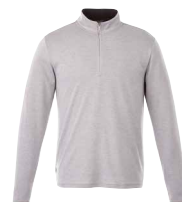
932 Heather Grey