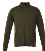
684 Loden Heather