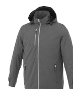
991 Grey Storm