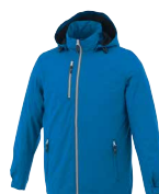
431 Olympic Blue

The Ansel Jacket is a sleek, critically seam sealed jacket with a waterproof, breathable coating and water repellent finish. Mother Nature doesn't stand a chance with the latest jacket in water protection. This modernized rain jacket is designed with a detachable snap off hood featuring an eye-catching graphic drawcord, interior storm flap with rain gutter, zipper with contrast tape and white teeth, adjustable cuff tabs with velcro closure and dropped back hem. The Ansel carries all you need with an additional interior pocket with velcro closure and a secondary mesh stowable pocket.